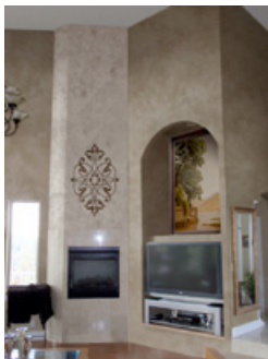
2. Digital Design Preview