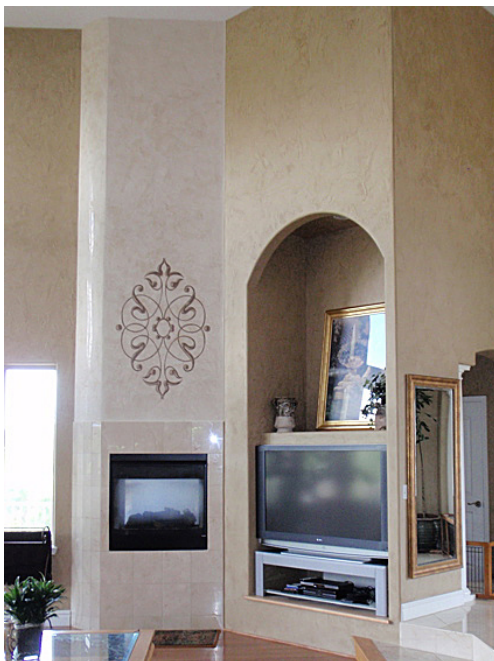
3. Work Completed